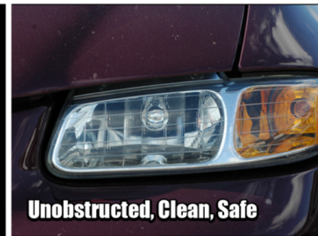
Unobstructed, Clean, Safe

Replacement is costly! The answer is Restoration!