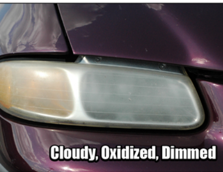
Cloudy, Oxidized, Dimmed